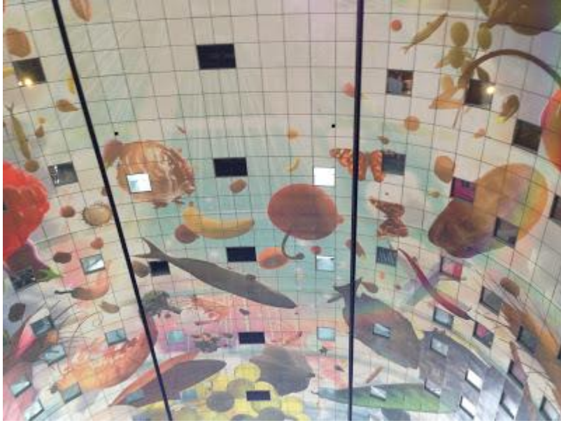
More from the ceiling.

We were also told about how Rotterdam was bombed during the Second World War, and that the city therefore had to be rebuilt almost from scratch.