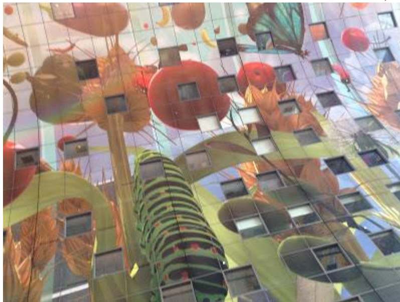
Part of the painting covering the ceiling.